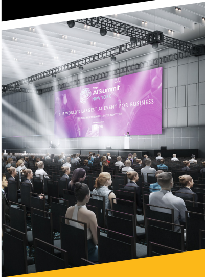
SPECIAL EVENT SPACE